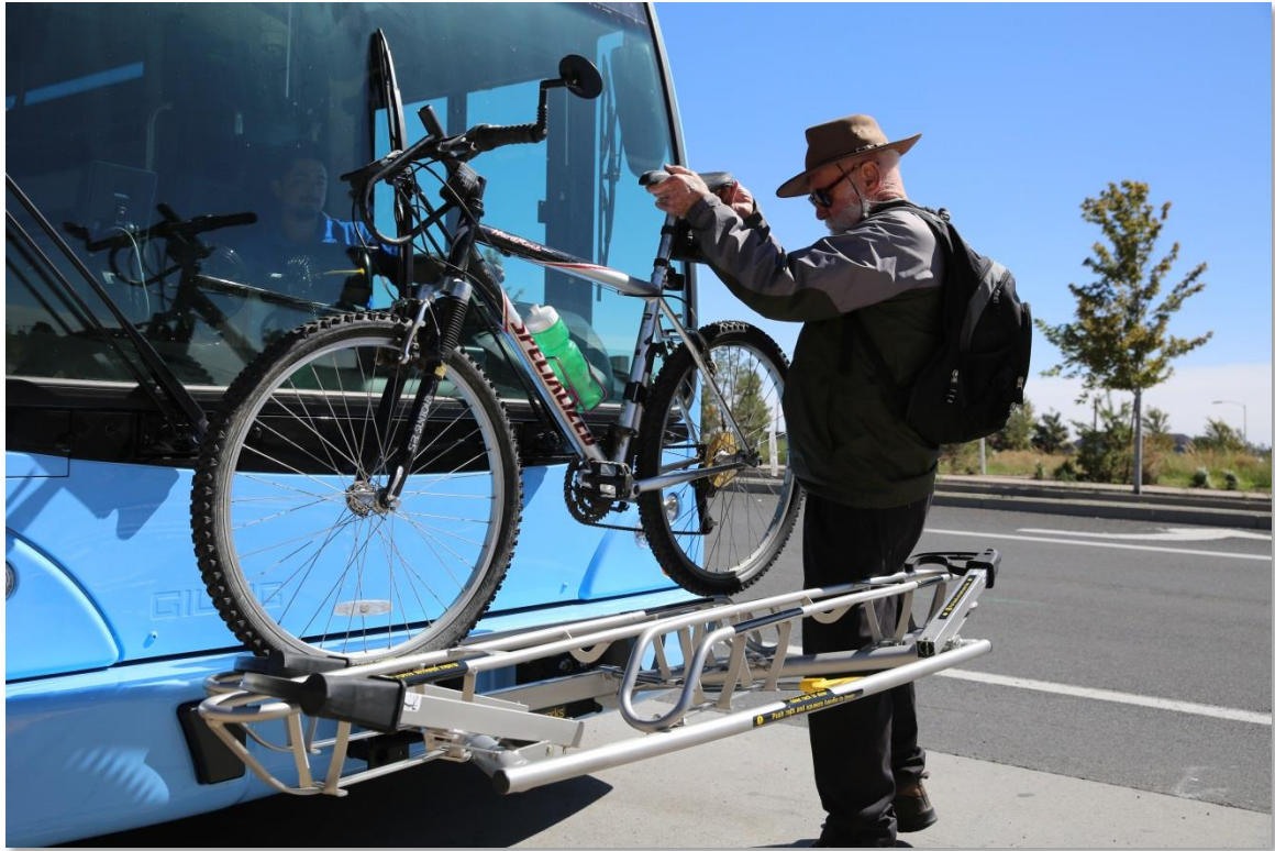
Photo of NAIPTA's Travel Training Program

* Flagstaff Unified School District is larger than the FMPO but smaller than all of Coconino County. Could not receive FMPO data for this demographic.