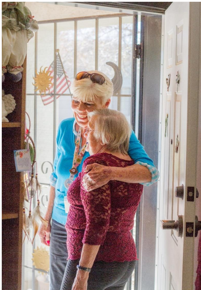
Photo of NAU's Senior Companion Program